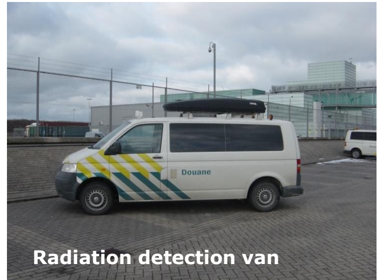
Radiation detection van