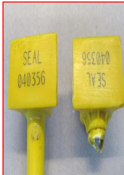
Forged Seal Numbers (Door Seal Cut by CBP)

Forged numbers are only slightly darker than the factory numbers.