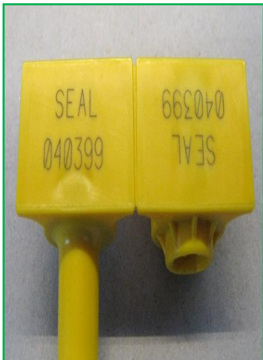
Legitimate Seal Numbers (Unused Spare Seal)

Note extensive sanding scratches in the face of the forged seal.