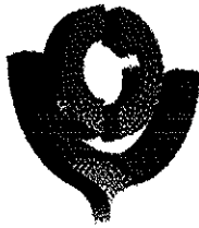
World Customs Organization