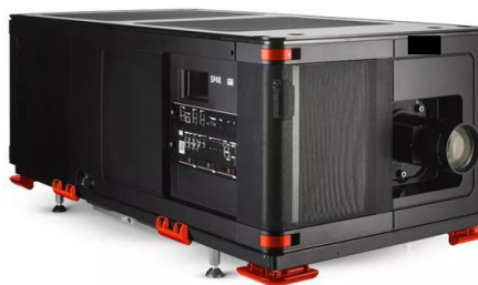
Main unit (the external cooler is not included in the picture)".